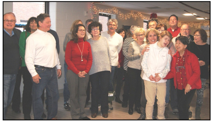
Last Christmas parishioners from St. Vincent DePaul Parish Richboro came to St. Edmond's to share the joy of the season with the children.